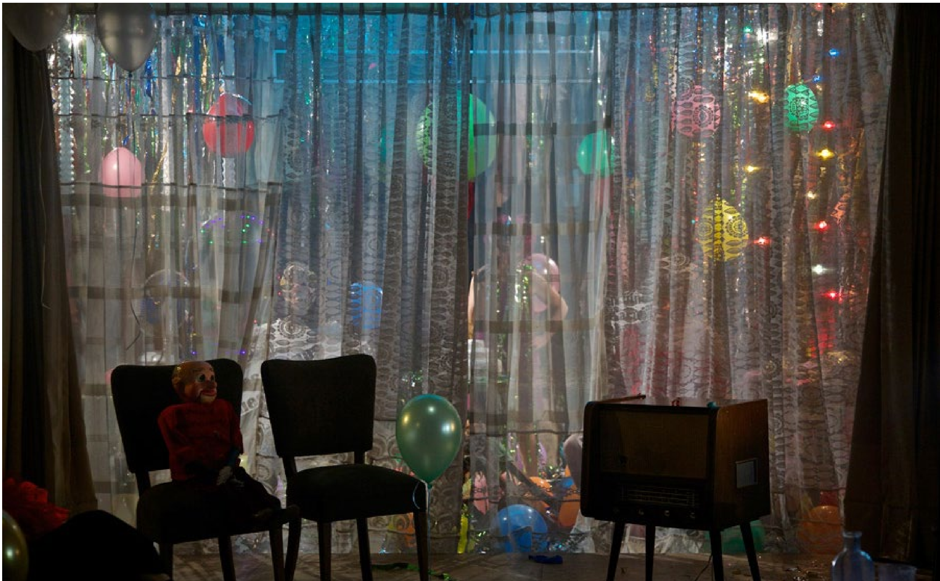
Mapa Teatro: Los Incontados: un tríptico