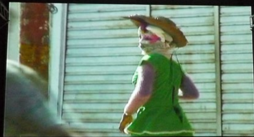
Mapa Teatro: Los Santos Inocentes

‘Get out of here, paracos (paramilitary), get out of here, guerrillos!’ Additionally, one cannot help thinking of the violence of the Christian colonisation of the indigenous people. Indeed, in this unique act multiple temporal layers of historical violent interventions are closely entangled, echoing cultural, political, and colonial violence throughout history. In a unique way, the event represents the disruptive spatial-temporal experience of postcolonial subjectivities. The fiesta is shaped by many layers and defines a space of being that is wrought from interruption, discrimination, and despair yet at the same time it is also a joyful outburst. ‘En toda fiesta está metido el enemigo’ (In each party the enemy is involved) is used by Mapa Teatro as a headline or motto for this part