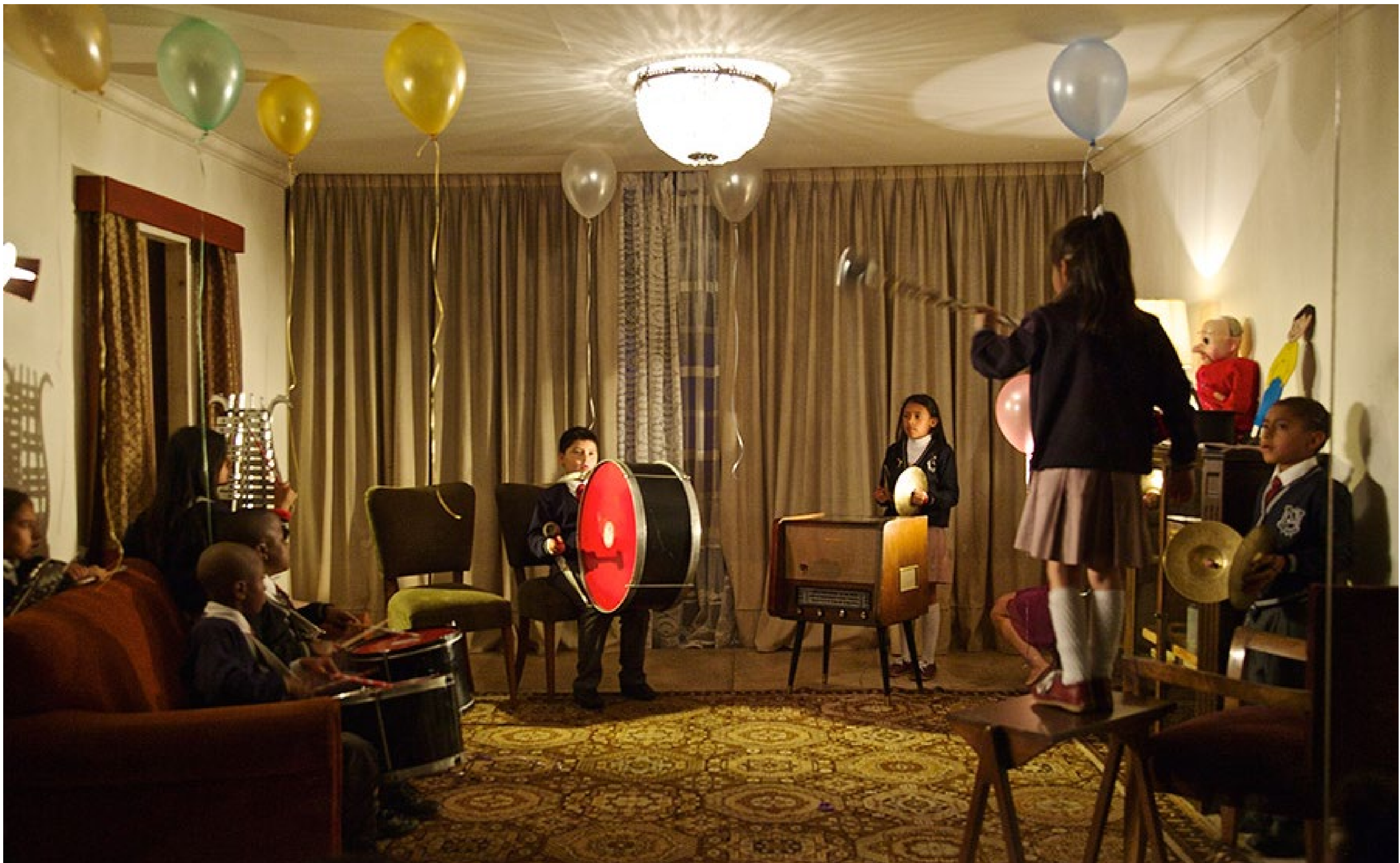
Mapa Teatro: Los Incontados: un tríptico