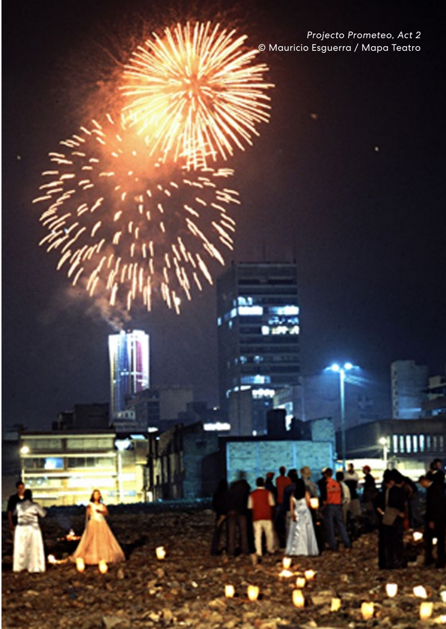
Projecto Prometeo, Act 2

merged, creating heterogeneous time-layers. Simultaneously, the project created a disparate movement of people. Former inhabitants and workers visited the Museum of Modern Arts for the first time in their lives whilst regular visitors of the museum went for the first time to the neighbourhood of Santa Inés. Against all expectations, the cameras on the pillars remained intact until the end of the exhibition. According to Rolf Abderhalden, it was remarkable that the community valued the images created more than the expensive objects of the cameras themselves. The symbolic necessity for memory outweighed economic needs.