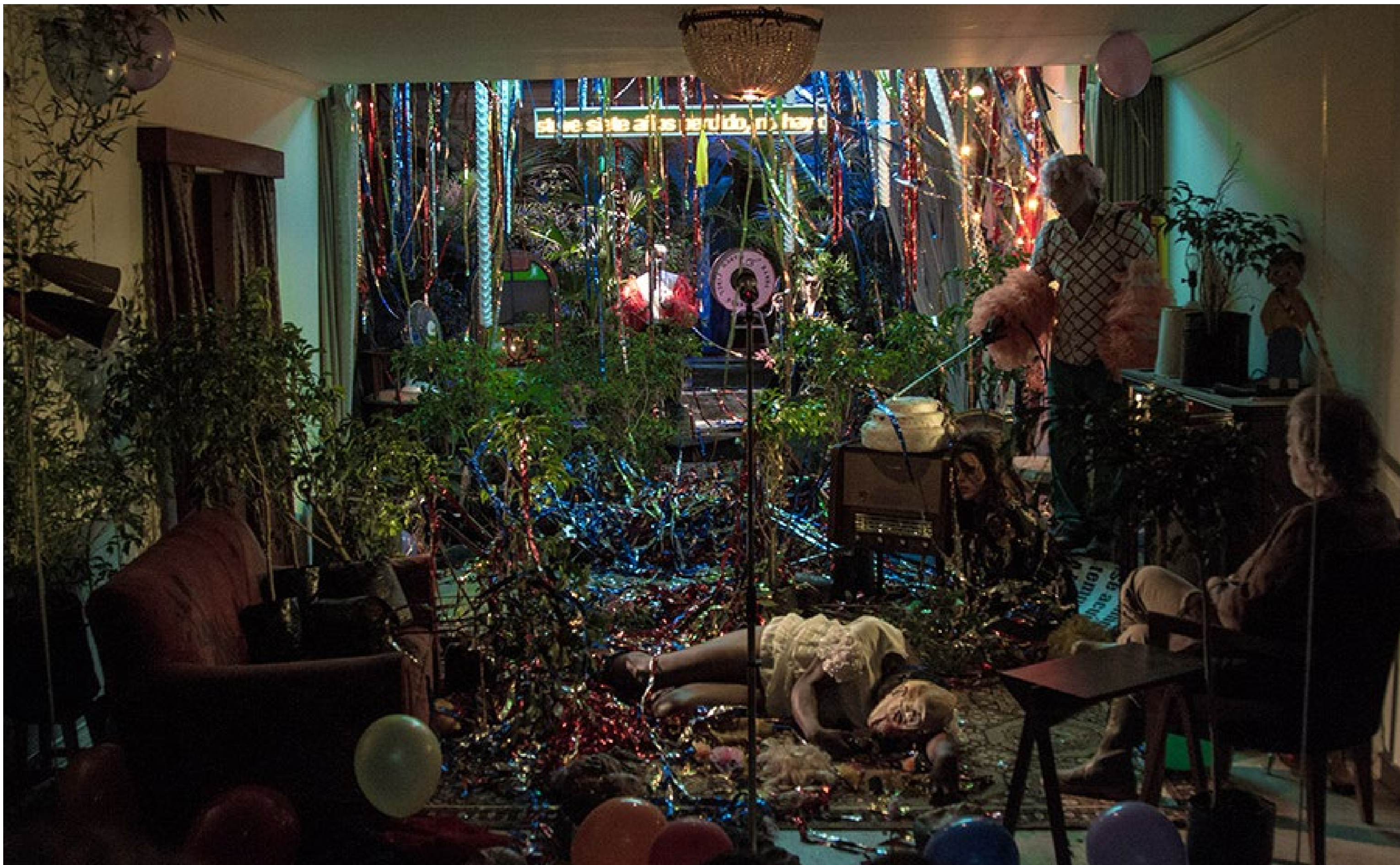
Mapa Teatro: Los Incontados: un tríptico