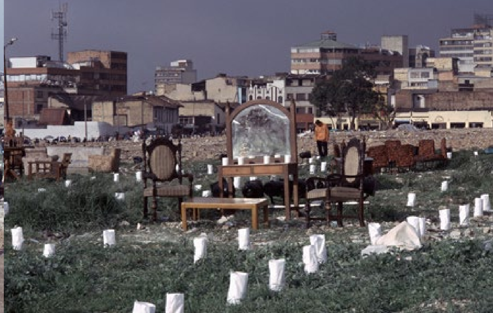
Proyecto Prometeo, Act 2

The third part of this project took place in the theatre of Mapa Teatro, which physically served as an installation in itself and a kind of a metaphor of the disappeared barrio . This was achieved by using every room and every corner of the theatre for different acts of remembering. The fourth part of the project, starting in 2004, was realised at two different places at the same time: in a part of Santa Inés and in the Museum of Modern Art in Bogotá. The title of this project again referred back to the myth of Heracles: La limpieza de los establos de Augias (The cleanliness of the stables of Augeas). With this last project, Mapa Teatro managed to create a remarkable movement of coming and going, a continuous transfer between the original, material space of the project, Santa Inés or El Cartucho , and the museum as a space of public significance for the dissemination of images. To achieve this the group worked on the basis