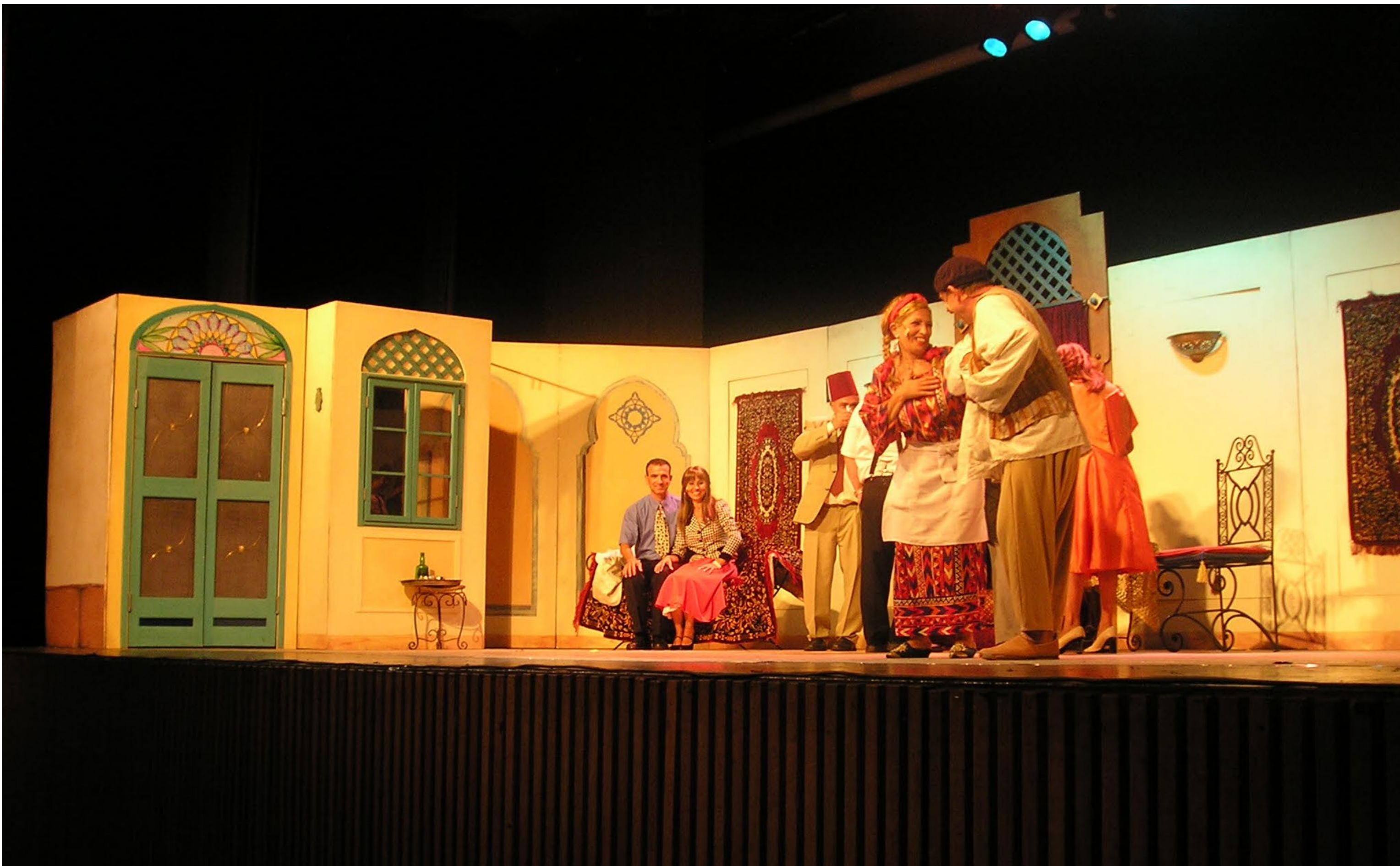
Figure 1 The Servant of Two Masters (2004), Moroccan Israeli Theatre ( Tami ), directed by Ronit Ivgy